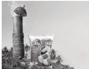
Rice & Wheat Products 06