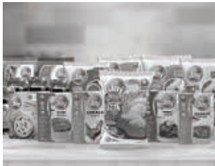
About Us 03