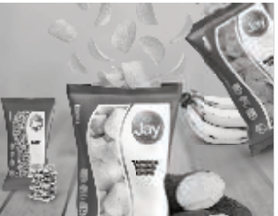
Chips & Snacks 10