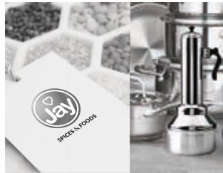
Pulses & Lentils Kitchenwares 13