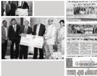
Varghese Moolan Foundation 12