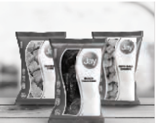
General Products 11