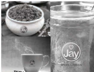
Chutneys Beverages & Jams 09