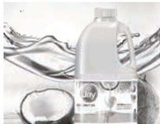
Oils, Oleoresins & Spice Essential Oils 07