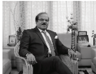
Varghese Moolan Group of Companies 14